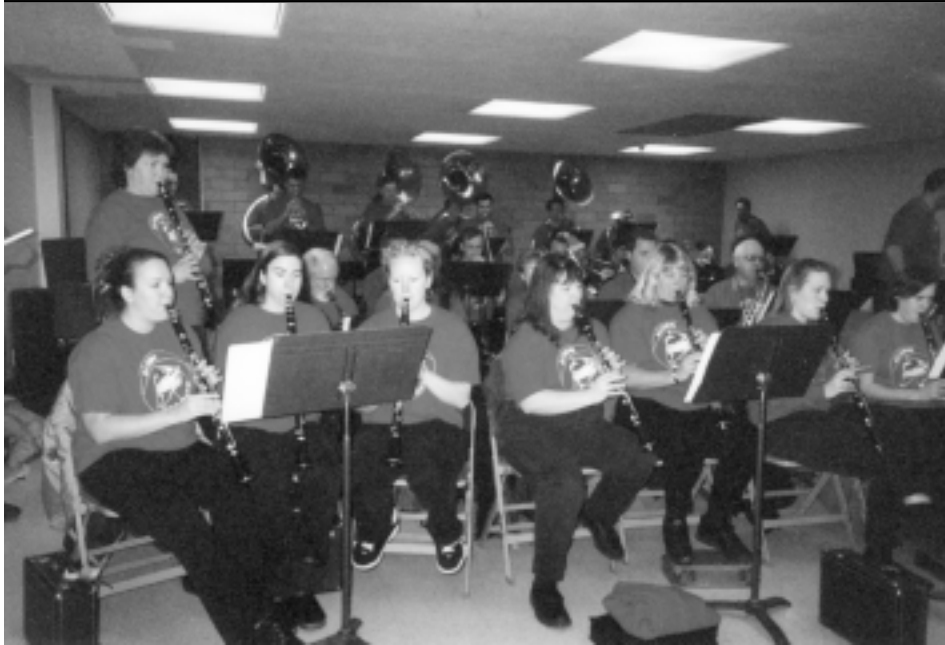
Practice before the Women's game.