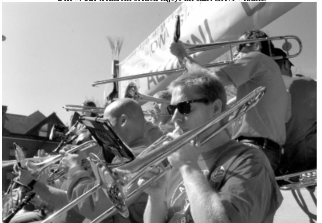
Below: The trombone section enjoys the shirt-sleeve weather.