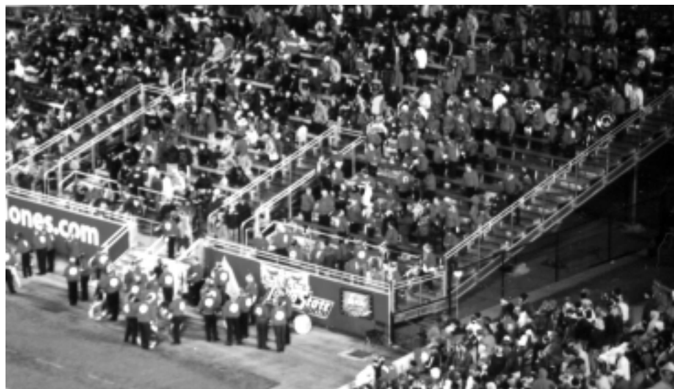
Right: The Pep Band forms in front of the Alumni Band section after halftime.