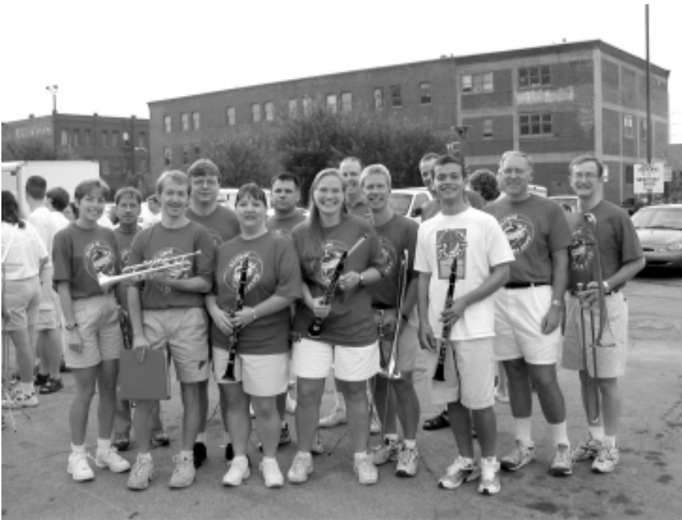
ISUAB ringers helped fill out the Farmer's Market Band.