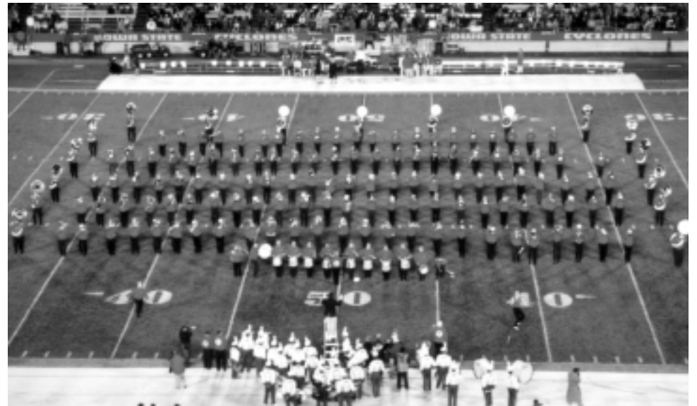
Above: Under the lights at halftime.