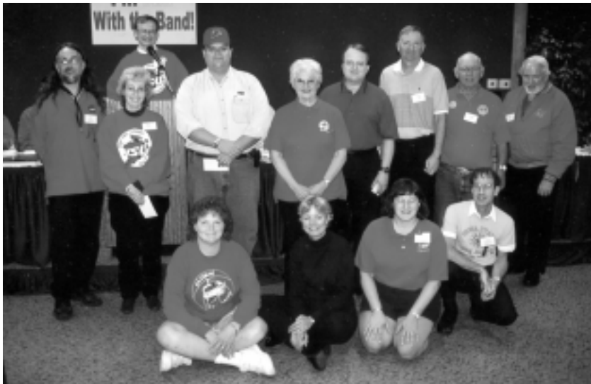
Above: Alumni Band members who have attended all 22 Homecomings.