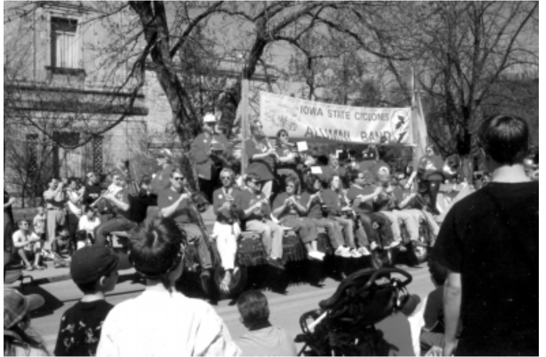
Above: The Alumni Band float passes Parks Library.