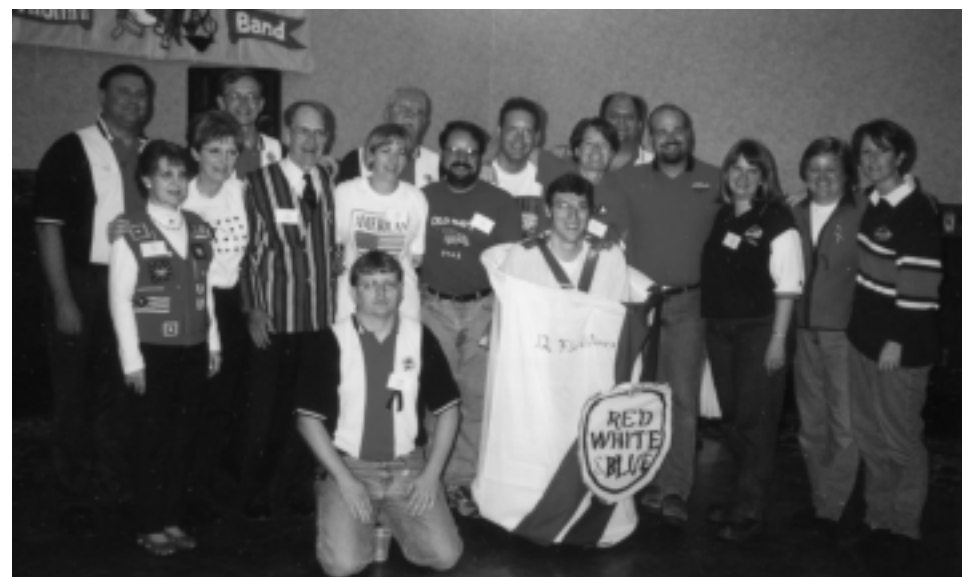
The Alumni Band attendees who wore Red, White and Blue on Friday night.